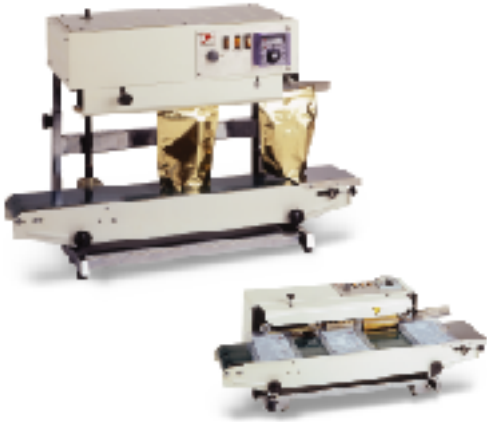
TABLE TOP BAND SEALER